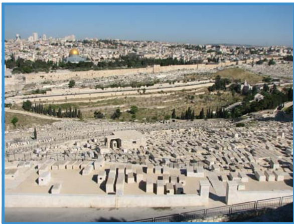
Panoramic View of Jerusalem